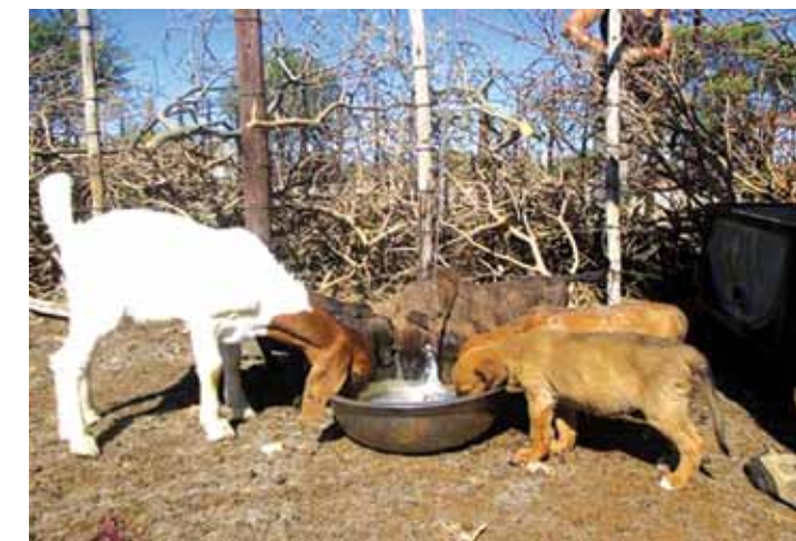
Dintsanyana tse ke dingwe tse di rutiwang go disa ko lesakeng la CCB ko Ghanzi