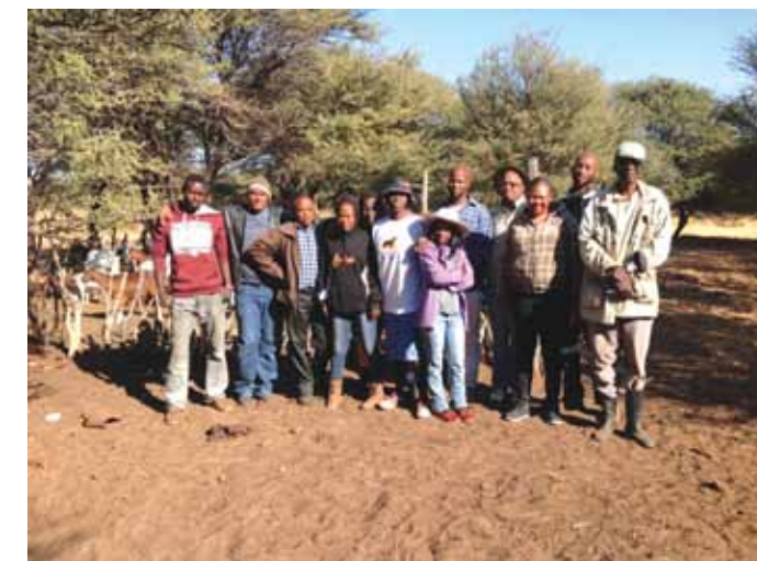
Maloko a SOLIFANE ba etetse barui ba ba dirang sentle mo kgaolong ya Ghanzi