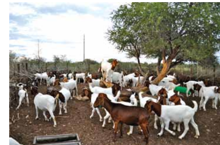
Lesaka la dipudi la CCB ko Ghanzi

CCB e leka go lemotsha barui gore go botlhokwa thata go nna le leruo la dipalo tse di lekanetseng le go jesa leruo la bone ka nako tsa komelelo. Ka re itse gore Ghanzi ke lefelo le le itemogelang mogote o mo montsi le dibatana ka go farologana, ko lesakeng re tlhokomisa gore dipudi tsa rona di nna di na le metsi ka nako tsotlhe le gore di lala mo lesakeng di patilwe ke dintsa tse di disang. Lesaka le, le dirisiwa ele sekao sa thuo ya dihutshane, go supa methhale e morui a ka e dirisang sireletsa leruo la gagwe mo dibataneng.