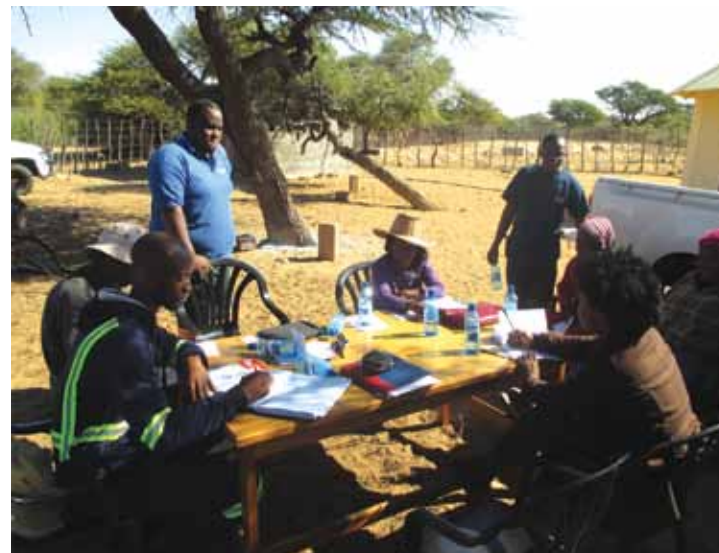
Maloko a SOLIFANE ba le mo bokopanong kwa Moleleme

Fa morui le ba malapa a bone ba dirisa madi go tsamaisa thuo ya bone, go tshwanetse ga nna le mekwalo ya thuo ee supang tiriso ya madi fa thuo e dira sentle le fa e sa dire sentle. Tse dingwe tse di ka kwalwang di ka akaretsa malatsi a bokopano le ditshenyegelo tse dingwe.