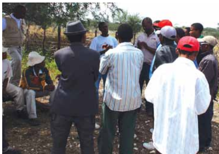
Young farmers learning about productive farm management methods at our demonstration farm.