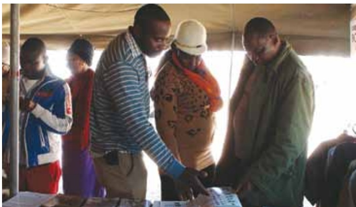
CCB staff connecting with the public at the Ghanzi Agricultural Show

We wrapped up our 10th anniversary celebrations with a reception dinner at Thapong Visual Arts Center in Gaborone on 6th December 2014. This was a time to express our sincere gratitude and appreciation to our donors, supporters, partners and the communities with whom the organisation has worked over the past decade. Without their support, participation, conviction and commitment, CCB would not have made what strides it has in facilitating coexistence and conserving Botswana's cheetah populations.