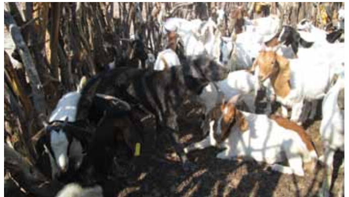
CCB assisted the Department of Wildlife and National Parks in its NHWC Project, which included constructing predator-proof kraals for farmers and placing LSGDs