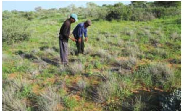
San trackers assisting CCB for scouting cheetah and spoor from other predators in Ghanzi

Results from this study indicate that we may be seeing localized increases in cheetah densities in the Ghanzi farmlands, which is an encouraging sign that our intensive work in the region may be having a positive effect on cheetah populations.