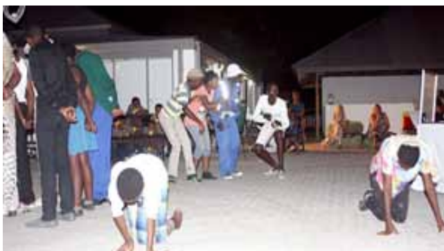
Boitumelo Mo Nageng theatre group performing at CCB's 10th Anniversary reception celebrations