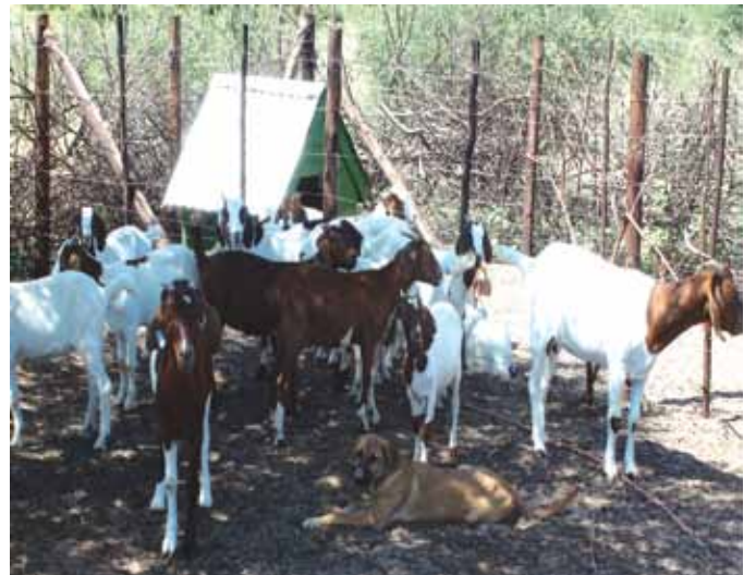
LSGDs relaxing with some goats inside one of the beneficiary kraals at Kacgae

This project was designed to test the long-term effectiveness and cost efficiency of farmer-predator conflict mitigation strategies like kraaling and the use of livestock guarding dogs (LSGDs). This project is one of the only ones in the region to test the long-term effectiveness of mitigation measures. After three years of data collection, this project will wrap up in April 2015, and we expect that the data analysis will give us a good understanding of the long-term effects of real world implementation of mitigation measures. These results will help mould our approach towards future farmer training courses and conflict mitigation interventions in order to improve the services we provide to the community.