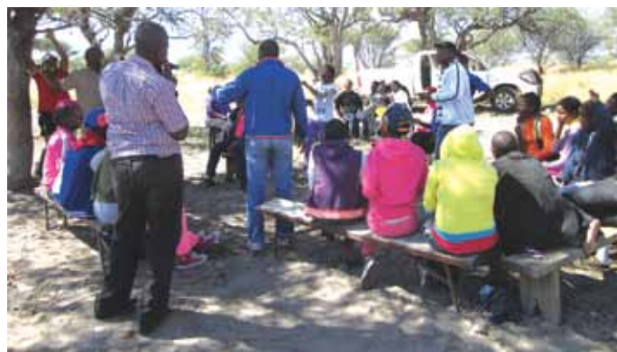
Kumakwane students enjoying a bush lesson together with CCB team members