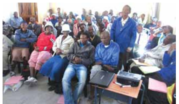
Zutshwa community members attending a the workshop in large numbers

The remote village of Zutshwa in Botswana's south-west, is a hotspot of human-wildlife conflict due to its proximity to the Kgalagadi Transfrontier Park. Carnivores moving in and out of the partially fenced protected area pass through the farming area and may prey on livestock. In conjunction with United Nations Office for Project Services, CCB responded to reports of high levels of carnivore conflict in this area, and four kraals were constructed to assist community members to protect their livestock and to promote coexistence.