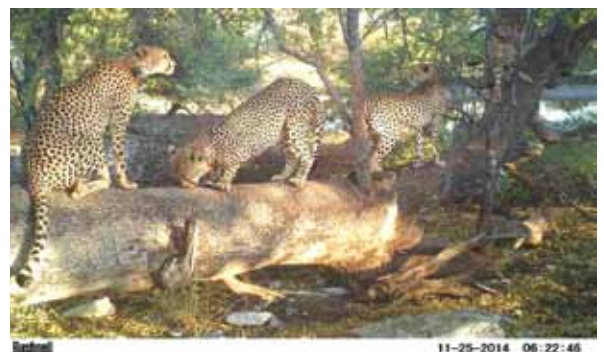
The Ring Brothers Coalition, seen on a marking tree at Dqae Qare Game Farm in Ghanzi

CCB's research team continues to monitor cheetah marking trees in the Ghanzi District in order to study cheetah populations and behaviour and to build on our national database of individual cheetahs. In May 2014, our research team were excited to discover a rarely seen coalition of four males, which were named "The Ring Brothers".