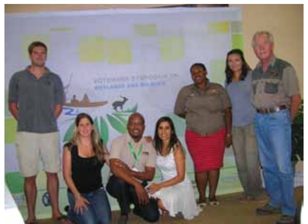
CCB representatives at the symposium