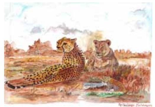
One of the art pieces submitted by students for the art competition