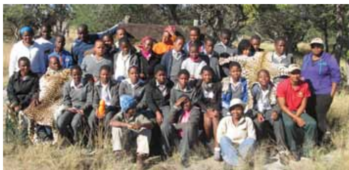
Kumakwane CJSS and CCB staff during their bush camp in Ghanzi

CCB's Tiisano Education Centre hosted Kumakwane Junior Secondary School for an educational bush camp from 14 – 18th April 2014. 30 standard 6 students stayed for four days in Ghanzi learning about the environment and the important roles that carnivores play in the ecosystem. They also learnt some of the threats to the environment and how to farm alongside carnivores without livestock losses, with a tour of our demonstration farm to highlight these techniques. Children who attend our bush camps get an exciting experiential learning experience and leave with newfound knowledge about the environment and a passion to conserve Botswana's natural resources.