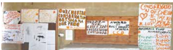
Kumakwane students left messages of thanks to CCB during their four days at our bush camp