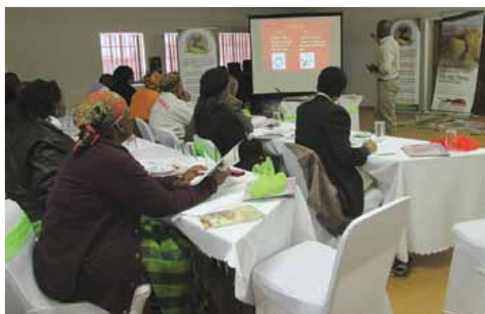
Farmers listening attentively at the Tlokweng regional workshop