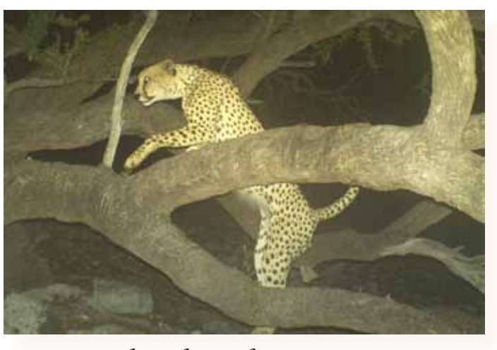
Cheetah caught in camera.