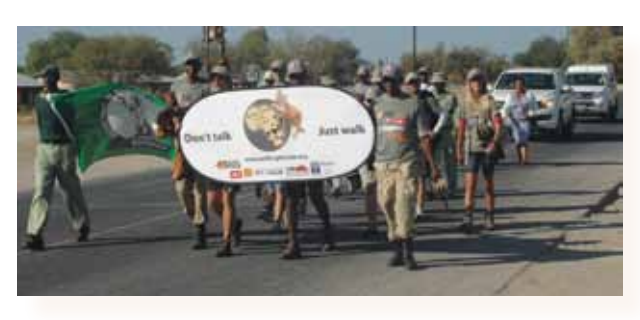
Walking for lions in Ghanzi.

The public relations unit of the Ministry of Agriculture organised a filming event to raise awareness of CCB's LSGD program in August 2013. The resulting video was subsequently aired on Botswana Television during the same month and CCB has received a lot of positive feedback about the program.