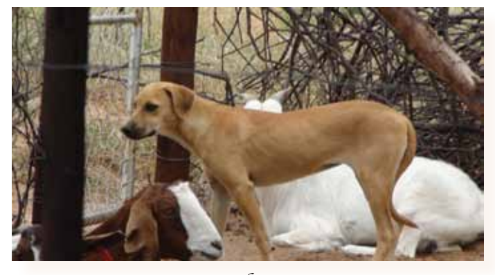
Some of Kacgae LSGD's relaxing with their herds.

Phale placing a motion activated camera in Ghanzi.