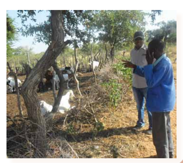
Kokole at a site visit in Kgatleng District discussing with a farmer on the use of LSGD's.