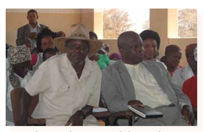
Maokatuma farmers workshop with Serowe Department of Wildlife and National Parks.