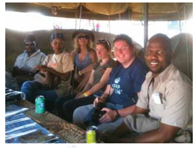
CCB team with volunteers at the Ghanzi show 2012.