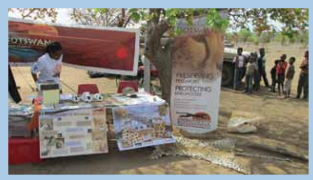
Keneilwe preparing the CCB stall to share information with Motlhabaneng community.