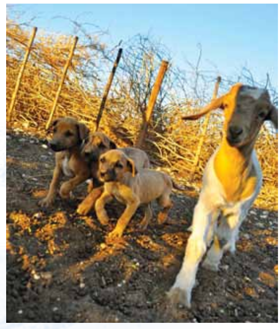
Puppies ready to work after being iintroduced to their herds in the Kacgae project.

Follow-up visits are continuing to be conducted at two weekly intervals to ensure the conflict mitigation activities are being used in the right way and farmer questionnaires are conducted every three months to monitor livestock losses, perceptions and problems. This study will continue for 3 years to monitor the long-term effects of these mitigation methods and to thereby measure the sustainability of these tools.