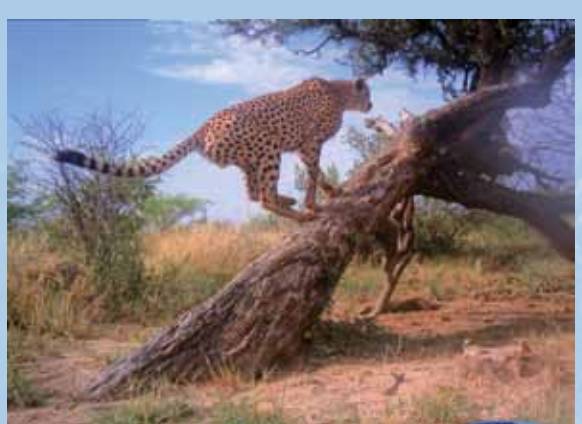
A cheetah at a marking tree at a farm in the Ghanzi area.