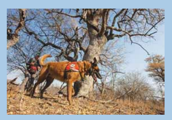
A scat detection dog with it's handler at work in the Ghanzi area.