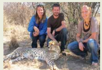
Smithsonian Conservation Biology Institute (SCBI) group from Washington DC, USA, seen here with one of Mokolodi cheetahs in 2010.

Topics that the Smithsonian could provide support for included: reducing human wildlife conflict; combating illegal trade; community based natural resource management and biodiversity monitoring. The conference took place in Gaborone on August 10-12th and was well attended by 32 participants who spent 3 days developing and prioritizing potential training programs for the country. It was extremely successful and the next step will be to decide on which of the training programs will take place in 2011. Many thanks to the Smithsonian group for choosing Botswana as the recipient for this significant support!