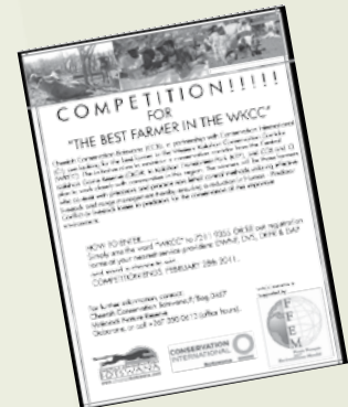
WKCC 2010 competition leaflet.