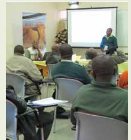
Dept of Wildlife staff member presenting at one of WKCC workshops in Kang.

CCB was engaged by Conservation International (CI) on the implementation of the WKCC initiative. The initiative aims to maintain the existing wildlife corridor between the 2 protected areas: the Central Kalahari Game Reserve (CKGR) and the Kgalagadi Transfrontier Park (KTP). 10 mobile workshops were conducted at settlements and cattle posts of the region to promote coexistence and effective management. A pilot project to test the use of mitigation methods that can reduce livestock losses has been initiated at 4 locations. 4 farmers are being assisted to improve their management techniques and assess the effect on reducing conflict. A competition for the Best Farmer in the WKCC