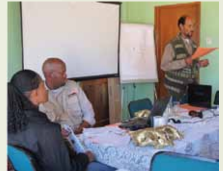
A farmer doing a presentation at one of WKCC workshops Ghanzi.

2010 saw the development of a demonstration goat farm at CCB's Ghanzi camp. A fully functional demo area with 16 goats, 2 livestock guarding dogs, a sturdy kraal, a full-time herder and herder's accommodation was completed. The farm aims to demonstrate and educate farmers how alternative management practices can minimise livestock losses to predators and reduce conflict with wildlife. Since its initiation we have experienced no livestock losses or injuries to our livestock from predators, despite having brown hyena, jackals, cheetah and leopard frequenting the farm.