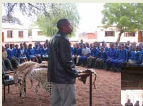
Above: One of many CCB school visits.

The focus of the workshops was to infuse predator education into lessons and curriculum. Each school received a school kit of books, activity guides, posters and DVD's. All teachers were offered encouraged to set up environmental clubs in their own schools.