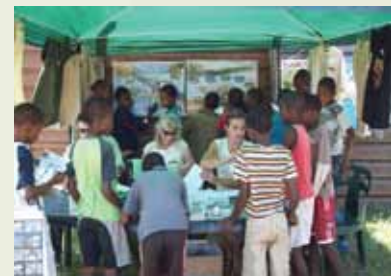
Ghanzi volunteers helping with CCB stall in Ghanzi.