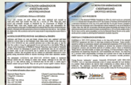
CCB/Mokolodi Cheetah/Hyena Ambassador Leaflet.