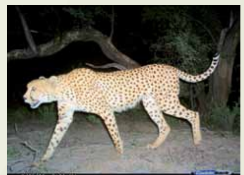
Camera trap at Ghanzi camp.