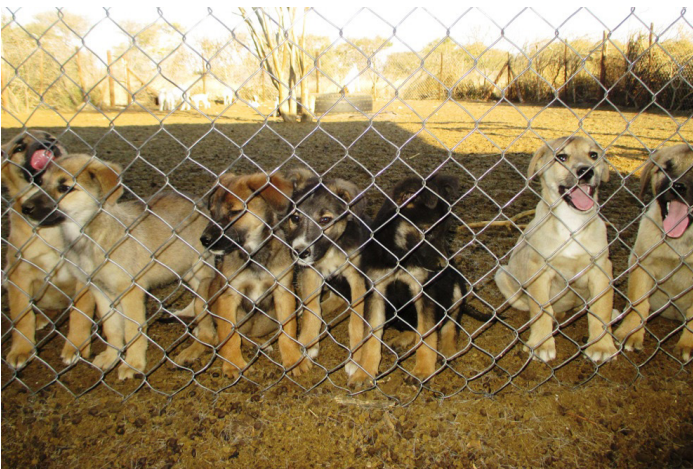
Dintsanyana tse di santseng di katisiwa ko lesakeng la ditshupetso la CCB

Lenaneo le la dintsa tse di disang le supile maduo aa nametsang mo go fokotseng tshenyoy ya dibatana mo leruong le go tlhabolola go tshela mmogo le dibatana bogolo jang sebatana sa letotse. CCB e setse e abile dintsa di le masome a mane le bobedi mo kgaolong ya Ghanzi mme dintsa tse go supafala fa di dira sentle mo tirong ya tsone ya go disa. Mo legatong le lengwe, CCB ba tsere tshwetso ya go tsenya dinku mo lesakeng go tokafatsa botsalano ba dinku le dintsa tse di disang bogolo jang dintsa tse di abelwang barui ba ba nang le dipodi le dinku. Mo sebakeng se, lesaka la CCB le le na le dinku di le tharo, dintsa tse di disang dile pedi le dipodi di le masome a mathano le boraro.