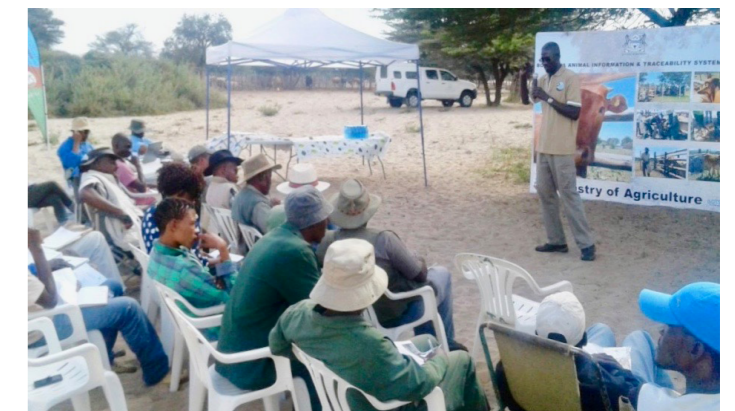
Ghanzi Smallstock Farmers Network members during a BAITs workshop at Lekanyane cattle post