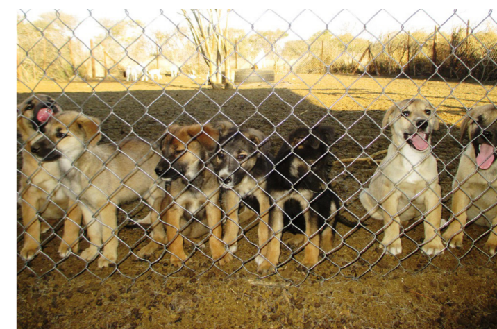
Seven puppies undergoing training at CCB's demonstration farm

The LGD programme is successfully reducing livestock loss due to depredation and promoting coexistence with carnivores especially cheetahs. CCB has so far placed 42 LGDs in farms around Ghanzi District, and the dogs are reported to be doing a good job of protecting their stock. In a new move, the CCB team decided to introduce sheep into our herd to help with training puppies that are destined for farms with both goats and sheep. Currently the demonstration farm has three sheep, two livestock guarding dogs and 53 goats.