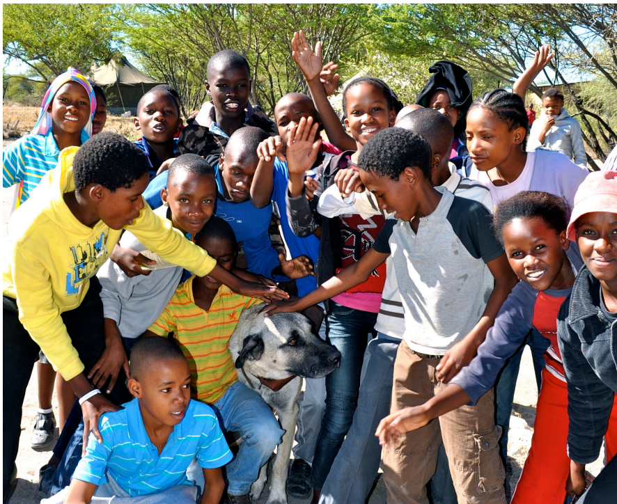
CCB's camp guard dog Murphy getting attention from some of our visitors

The Tiisano Education Centre is also home to CCB's guard dog, Murphy. Murphy is a very big dog and although he looks very intimidating, he is mostly a very gentle old dog. His job is to protect the camp and the CCB staff, so if he feels threatened by you he may growl or bark. If this happens, do not run. Stay still, bow your head and call his name and talk to him. Call for help if someone is nearby. This has never happened to any of our participants in camp, however, it pays to be prepared, especially if our visitors are intimidated by Murphy, which they sometimes are. Generally though, he is incredibly friendly and his presence is a highlight for many students who visit.